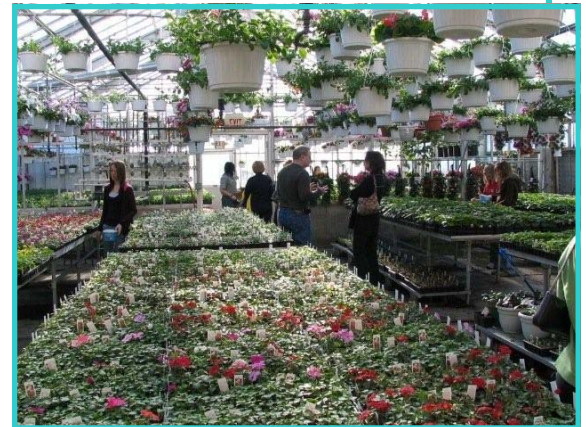
Knox County Career Center Horticulture Greenhouse

We will be doing a PowerPoint of photos from our experience and will work together via email to create a presentation that involves everyone in our class.