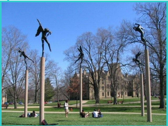
Sculpture at Kenyon College in front of Rosse Hall.

To view all of the photos from the Leadership Knox day, go to the chamber website, www.knoxchamber.com , and click on photo gallery on the front page. The chamber is now accepting applications for next year's Leadership Knox class. Visit our website, www.knoxchamber.com , or contact the chamber office for additional information.